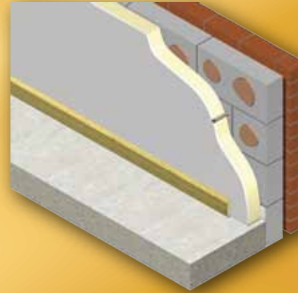
An example of how a wall is drylined. Notice how no battens are needed.

Dry Lining can be used in conjunction with cavity wall or attic insulation to give extra value to the heat saving properties of your home. Often used in attic conversions or on walls that are otherwise not insulated properly, it is cheaper and more effective than external wall insulation with the potential of saving you up to €600 a year on your energy bills. When combined with attic and cavity wall insulation, a typical 3 bed semi-detached house could save around 2.4 tonnes in CO2 emissions a year. Dry lined walls also help reduce the existence of mould in damp-prone areas of your home.